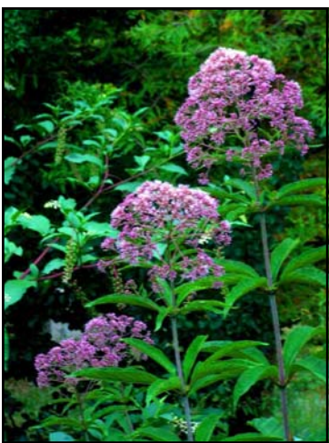
Joe Pye Weed Eupatorium maculatum Blooms: July-September Height: 3-7' Soil: Wet Sun: Full sun to part shade