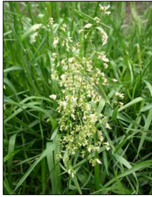
Sweetgrass Hierchloe oderata Blooms: July-August Height: 1-2' Soil: Moist to wet Sun: Full sun to part shade