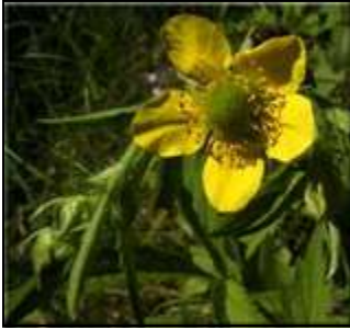
Golden Avens Geum aleppicum Blooms: Summer Height: Up to 3' Soil: Medium Sun: Full sun to part shade

ORDER BY SEPTEMBER 20 FOR PICKUP OCTOBER 1 ALGER CD OFFICE (M-W-TH from 8:30-2:30) 906-387-2222 Or download order form and mail to ACD, 101 Court St., Munising, MI 49862 www.algercourthouse.com/Conservation