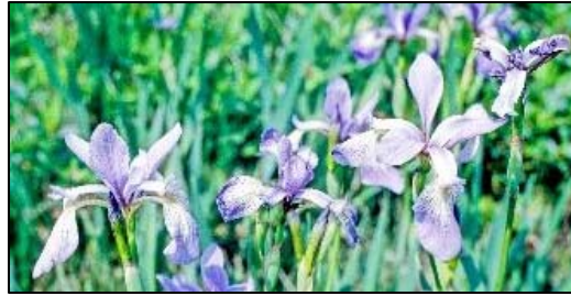
Blue Flag Iris Iris versicolor Blooms Jun-Jul Height: 2-3' Soil: Wet; seasonally wet Sun: Full sun to part shade