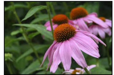
Purple Coneflower Echinacea purpurea Blooms: June-October Height: 1-3' Soil: Dry