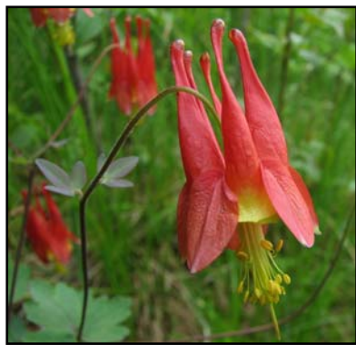
Wild Columbine Aquilegia canadensis Blooms: May-June Height: 1-2' Soil: Moist to dry Sun: Full sun to full shade