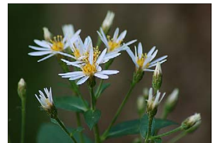
Large-Leaf Aster Aster macrophyllus Blooms: Aug-Sept Height: 1-2' Soil: Dry to medium Sun: Part sun to shade